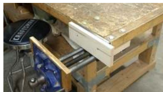
Replacement side vice installed