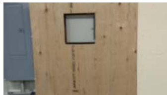
Wall Panel installed