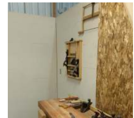
TNT Corner with plane rack