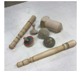
Tops & wands turned during SIG meeting