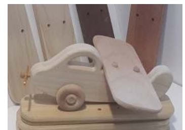
Airplane assembled and ready for playing