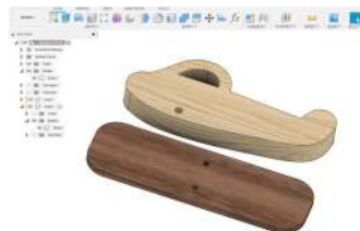
Pattern created in Fusion 360 ready for cutting