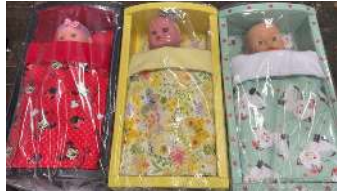
Babies in Cradles