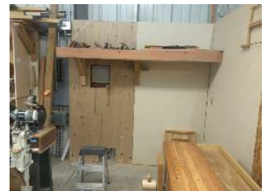
Completed storage shelf, with saws and planes temporarily stored on top for the tool storage project

The second session was the completion of storage shelf for interim storage of TNT project material after making access for the low voltage entrance conduit. There was some experimenting with a French cleat system for tool storage. Three new members attended and expressed their opinion on what they would like to see. One member received instructions and successfully corrected the "set" on their heirloom hand saw.