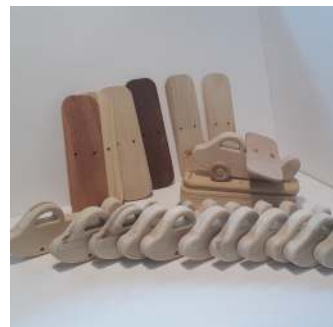
Twelve airplane parts cut on digital router