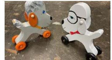
Puppies on wheels