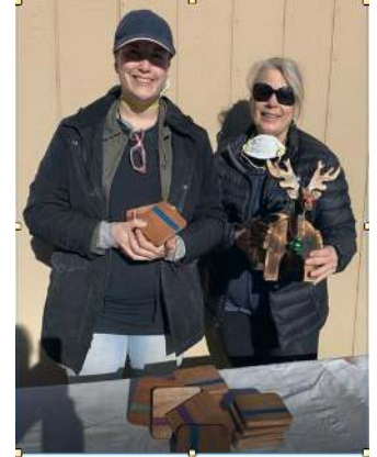
Mother & Daughter

I learned what strategies and accommodations worked with the daughter to help her be successful. She is an auditory and tactile learner so this was incorporated into this experience. With the exception of the band and scroll saws, she was able to use the other tools with my guidance.