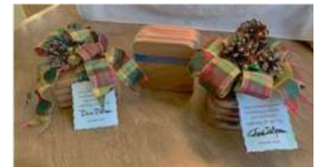
Coasters & Pine Cones