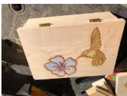
Completed Jewelry Box