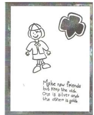
Scouts thank you note

A "Thank You Note" was signed by the girls and many remarked that this is a forever keepsake.