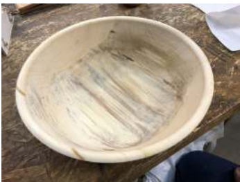
Finished bowl from coring demo

Photos from the lathe SIG Show & Tell at meetings in September.