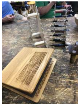
Engraved note book folder (engraved with laser), Band-saw Moose, pen holders