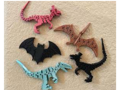
Articulated Dinosaurs made on 3D printer