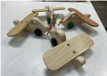
Air planes from parts cut out on digital router

The articulated dinosaurs were made on a 3D printer - Nice Job, Jerry! Thanks