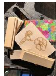
Kit prepared for Scout