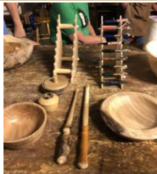
2 Wanes, 2 bowls, 2 lidded bowls, 2 pen display holders made on digital router