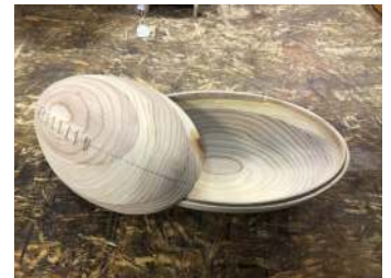
First try at lidded football chip bowl made on digital router